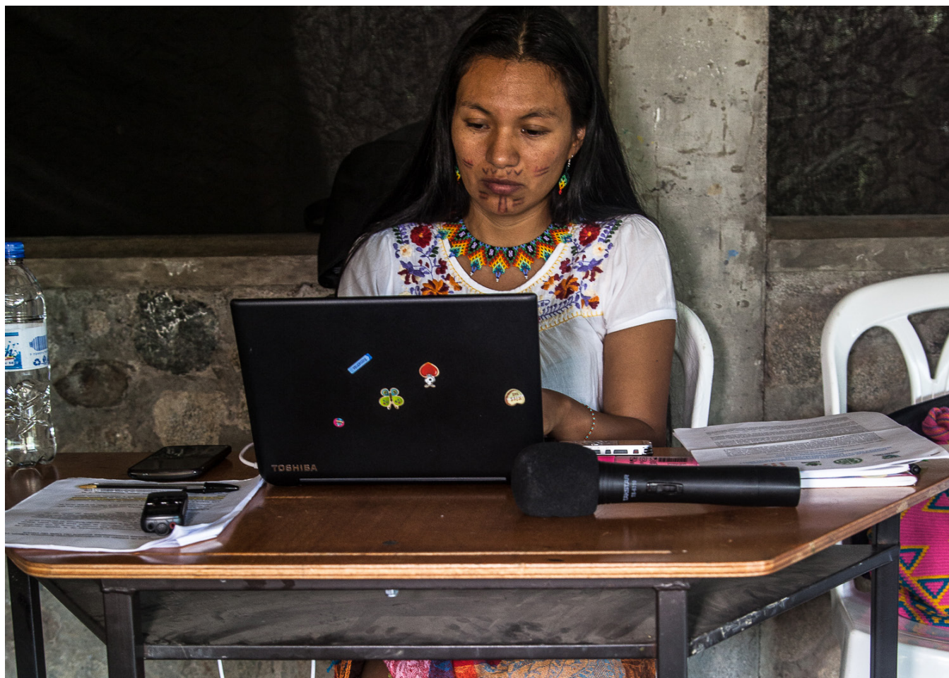
UNFPA Latin America and the Caribbean

Despite progress, accountability to survivors of TF GBV through law and policy remains a challenging area to address. Existing legal frameworks are often insufficient and lag behind rapidly evolving technology and emerging forms of violence. Even though there is growing recognition of TF GBV as a form of discrimination that violates a range of human rights and freedoms, including the rights to access information and participation; to a life free from violence; to freedom of expression; to privacy; and to participate in public and political life, available evidence highlights an important structural gap in accountability mechanisms. There is a high rate of failure by law enforcement to implement appropriate corrective measures to tackle TF GBV (UNFPA, 2021a; The Economist Intelligence Unit, 2021).