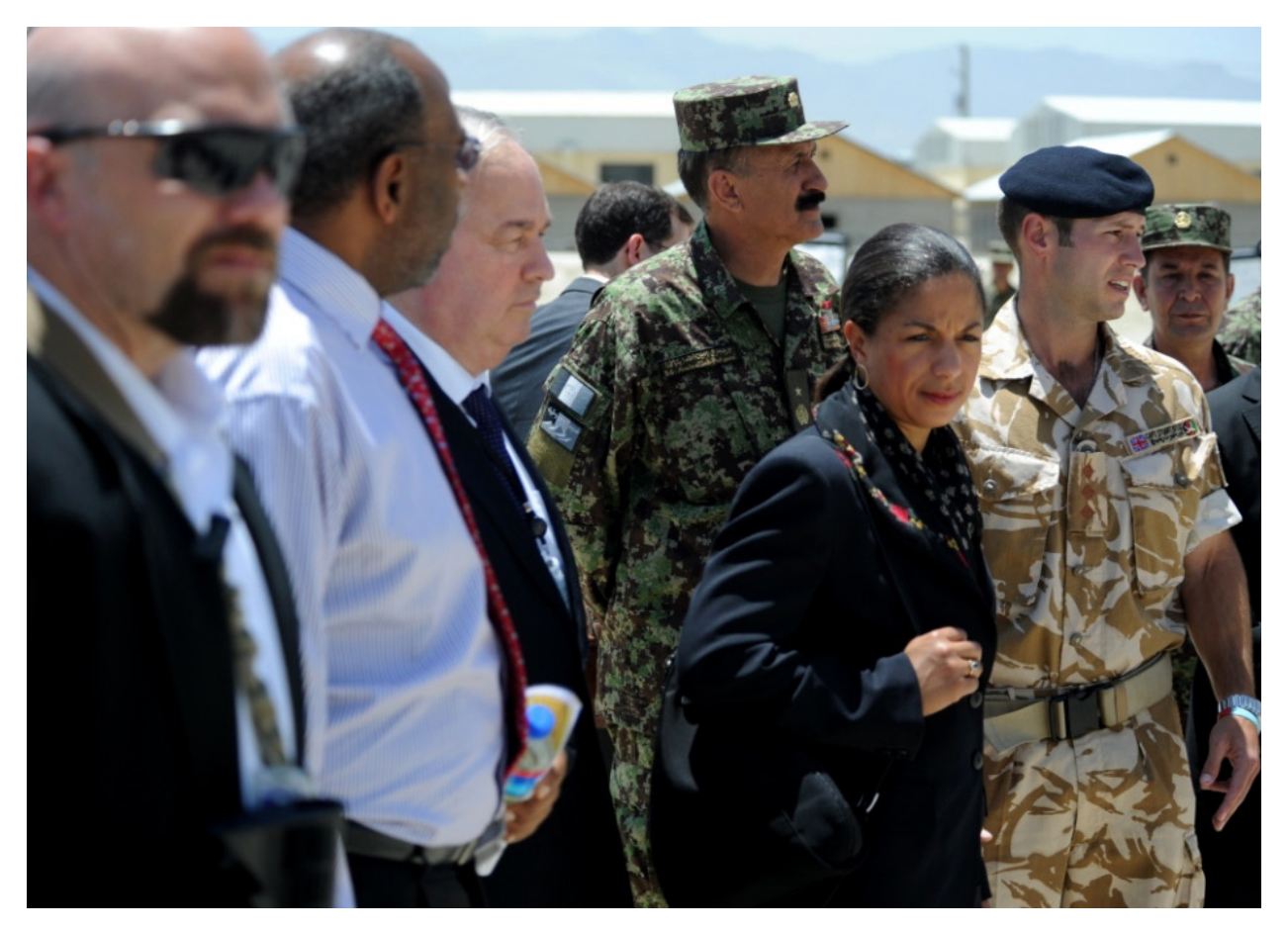
UN Ambassadors watch Afghan National Army weapons training in Kabul. (June 22, 2010, US Army)