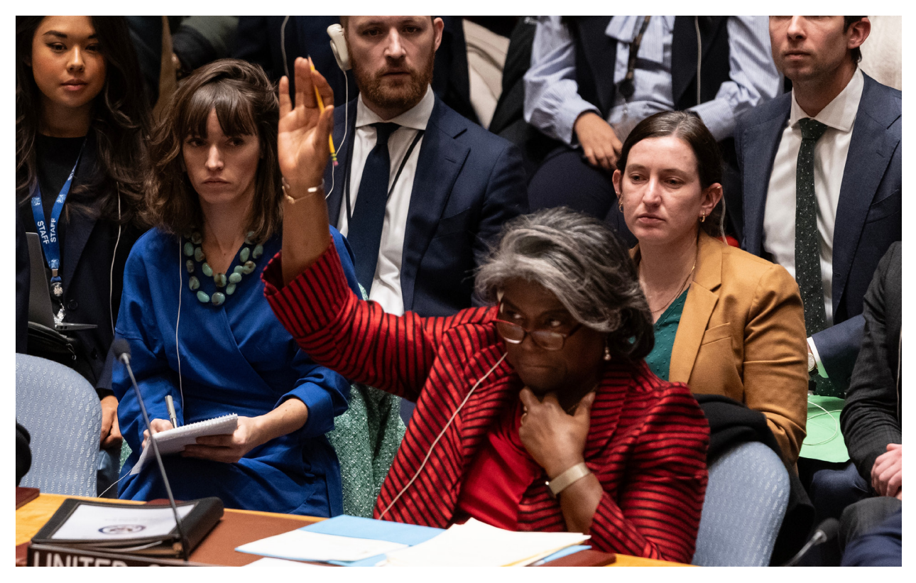
Ambassador Linda Thomas-Greenfield at a UN Security Council meeting. (December 22, 2023, lev radin/Shutterstock

sensitivities. Consequently, diminishing human rights standards under the guise of cultural sensitivity often stems from short-term political interests rather than genuine respect for local traditions. The crucial lesson here is that when entities like the UNSC or major powers intervene, they must avoid exhibiting reluctance, uncertainty, and inconsistency. These attitudes foster an environment where individuals and institutions prone to human rights violations initially fear international consequences but gradually become emboldened due to perceived international ambivalence.