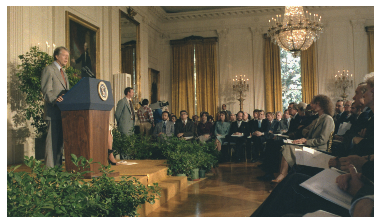
President Jimmy Carter hosting a ceremony commemorating the 30th anniversary of the Universal Declaration of Human Rights. (December 6, 1978,)

These reports, drawing on my personal experiences and interactions with numerous human rights defenders across various countries, have become essential reference points for domestic advocacy. They play a pivotal role in igniting media debates on human rights issues and act as resources for civil society activists in different countries. However, despite their importance, the findings of these reports often remain isolated, seldom impacting policy decisions.