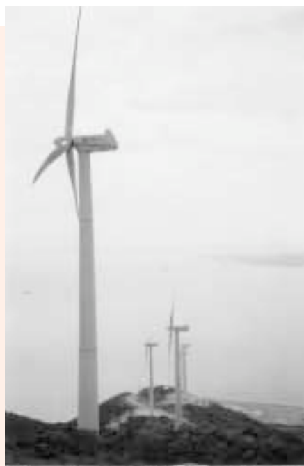
Windmills in Operation on Nan'ao Island

A visit to China's Nan'ao Island should be enough to convince anyone that wind turbines can be beautiful structures. Driving up the dirt roads to the turbine sites, one is greeted by tall, futuristic towers lining the ridges of the island's mountainous terrain and from the turbine site one can gaze down at the green island