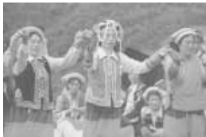
Yi Women Celebrating After Road Construction

The plan has served both as a learning site and a takeoff point for scaling up to other areas in Lashi watershed.