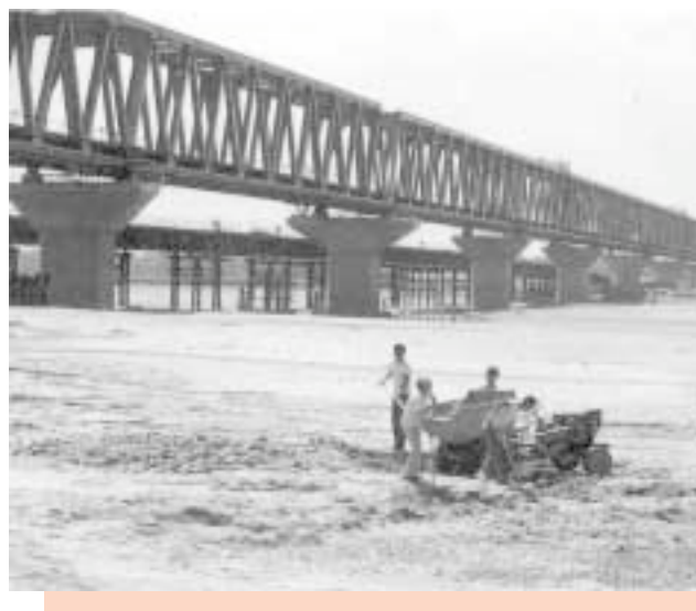
Collecting Sand from the Dry Bed of the Yellow River

The conflict in the Yellow River Basin illustrates the challenges facing China’s current water governance system. The top-down system of allocating water has proved incapable of balancing water needs and preventing disputes, especially in times of water stress. Fears of having their water reallocated to other regions prompt local governments to construct diversion projects in order to show they are fully using their water allocations (e.g., Shanxi province constructed the Wanjiakai Diversion