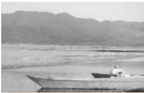
Fishers on Lashi Lake

significantly influence the Mekong's flow and water quality, as well as the livelihoods of communities in Southeast Asia.